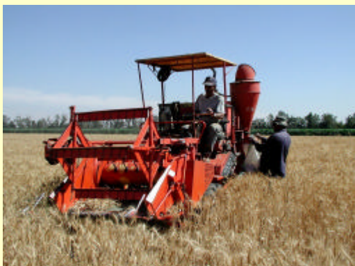
Field trials in Israel